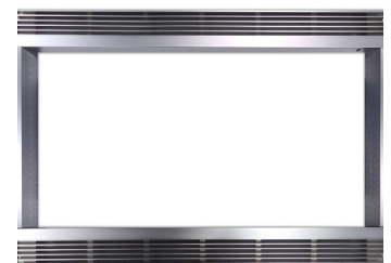
RK52S27 / RK52S30

Internal capacity calculated by measuring maximum width, depth and height. Actual capacity for holding food is less.