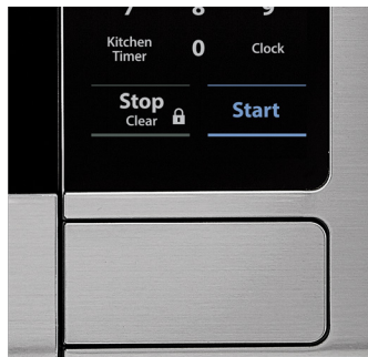
Handle-less, push door modern design matches all styles of kitchens