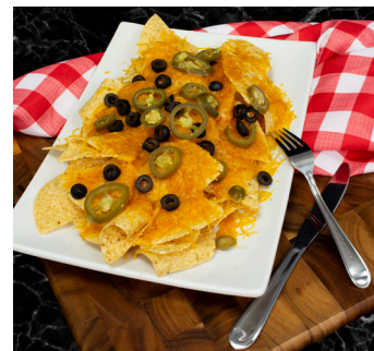
Sensor cook menu for precise cooking and reheating