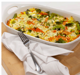
Extra-large, full-sized 2.2 cu. ft. capacity, to cook and reheat larger serving trays and casserole dishes

Innovative features like One-Touch controls, Sensor Cook Technology, Auto Defrost and the Carousel turntable system make cooking and reheating your favorite foods, snacks and beverages easier. With decades of experience designing smart, innovative microwaves, it's easy to see why home cooks throughout the world trust Sharp Carousel.