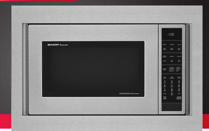
SMC1585BS Convection Microwave Oven with the RK-94S30 Trim Kit

Includes Ducts, Finish Trim, and Easy-to-Follow Instructions